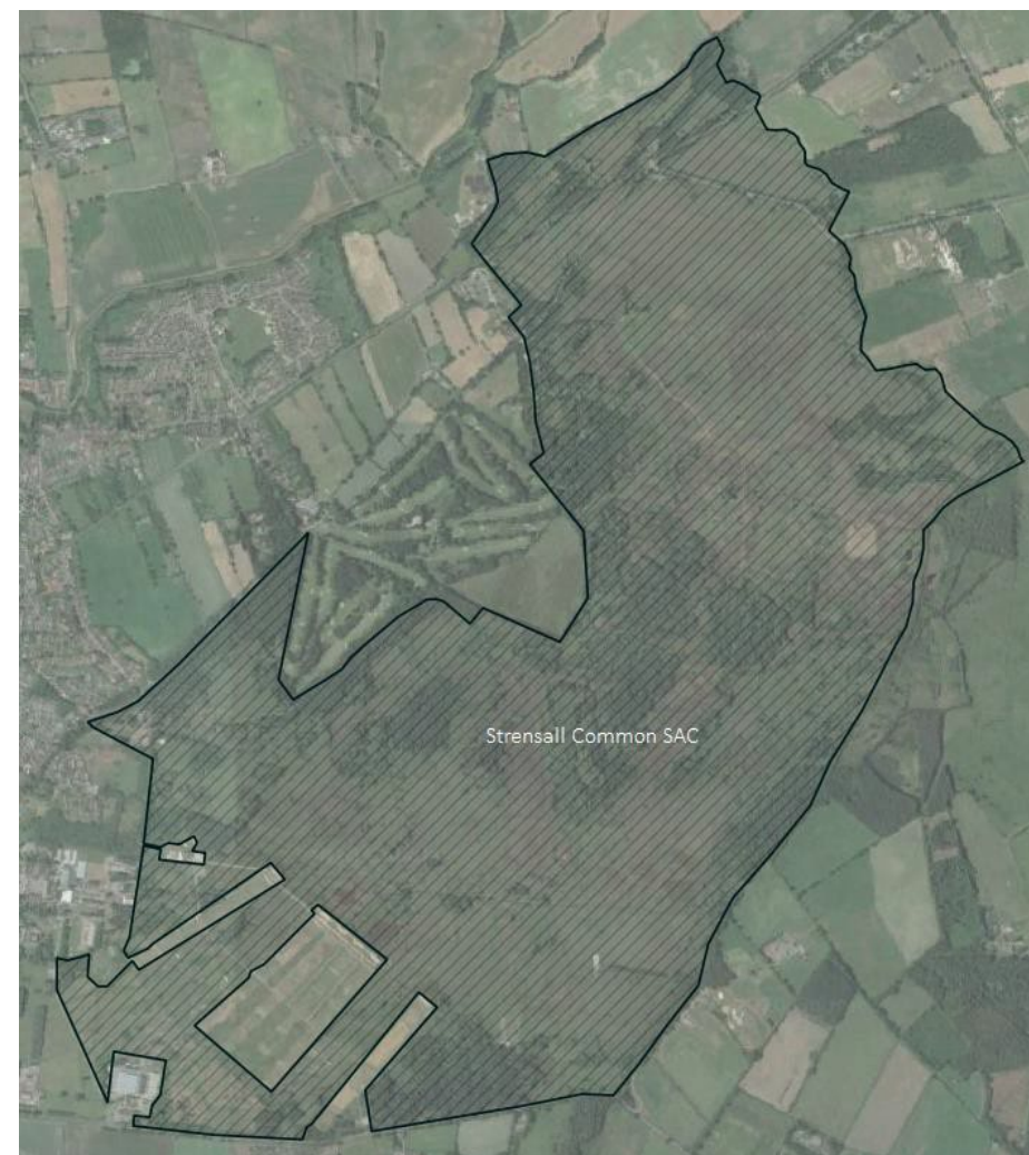
Figure 4 Strensall Common SAC