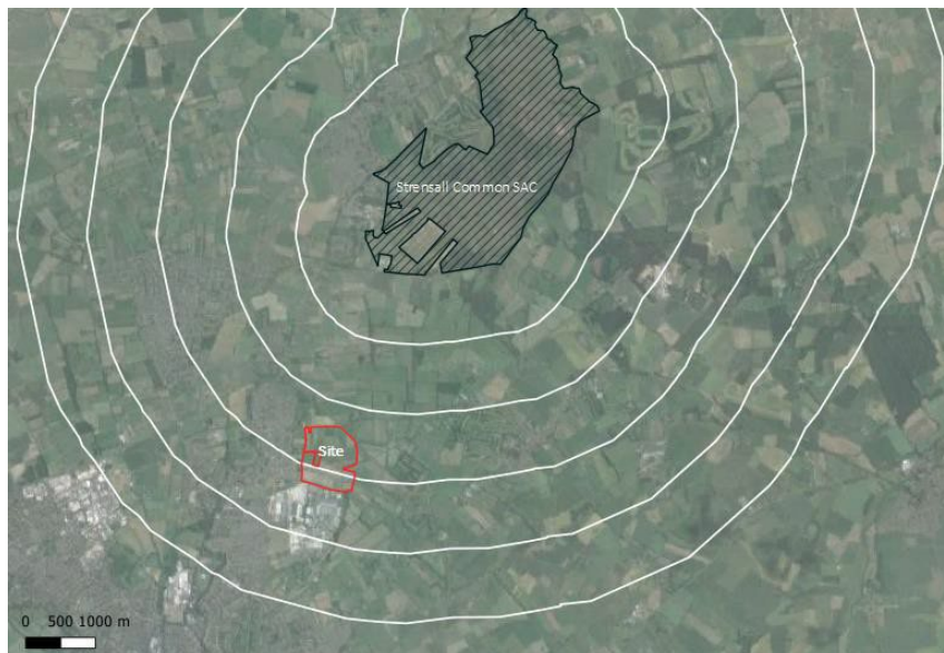
Figure 2 Relationship between the Site & Strensall Common SAC (1-5km radii shown).