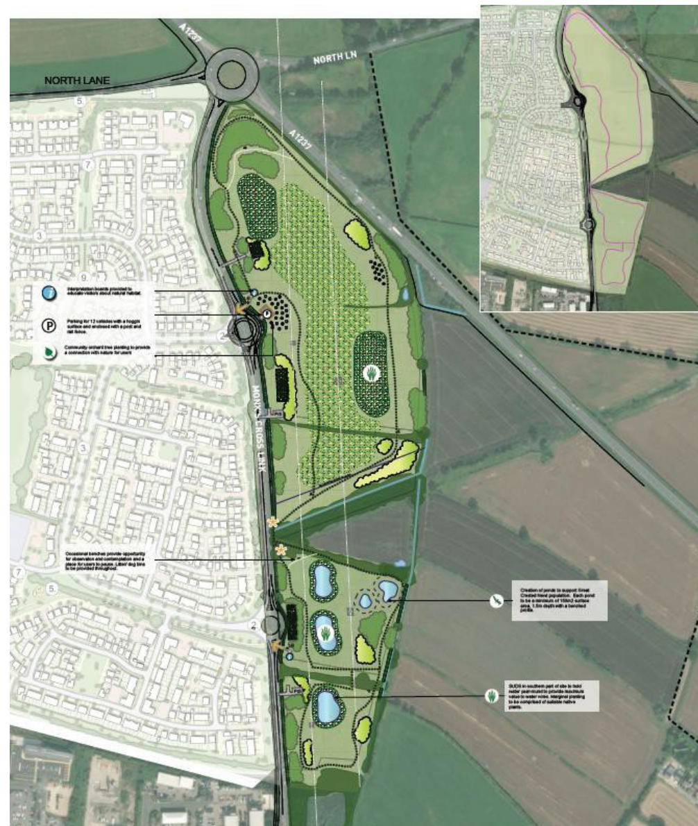
Figure 4 New Country Park designed to meet criteria for SANG