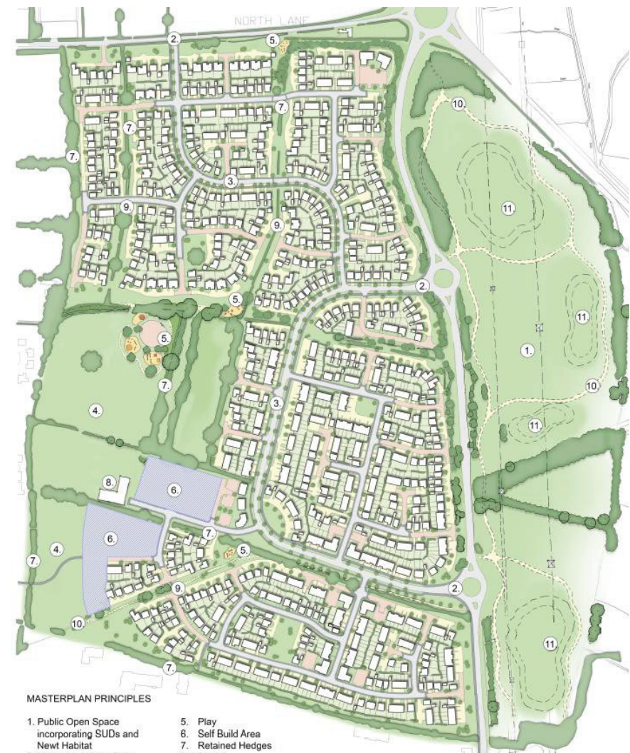
Figure 3 Illustrative masterplan